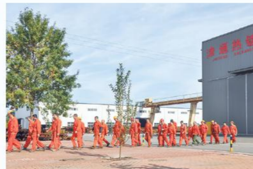
军事化管理 Military management