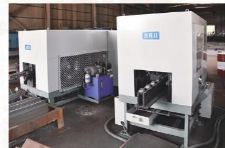
清根铲背机 Shovel back machine