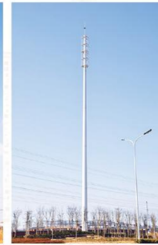
通信单管塔 Communication tower