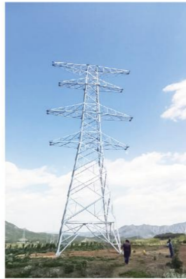
角钢塔 Angle steel tower