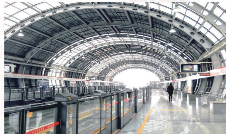
地铁钢结构 Subway steel structure