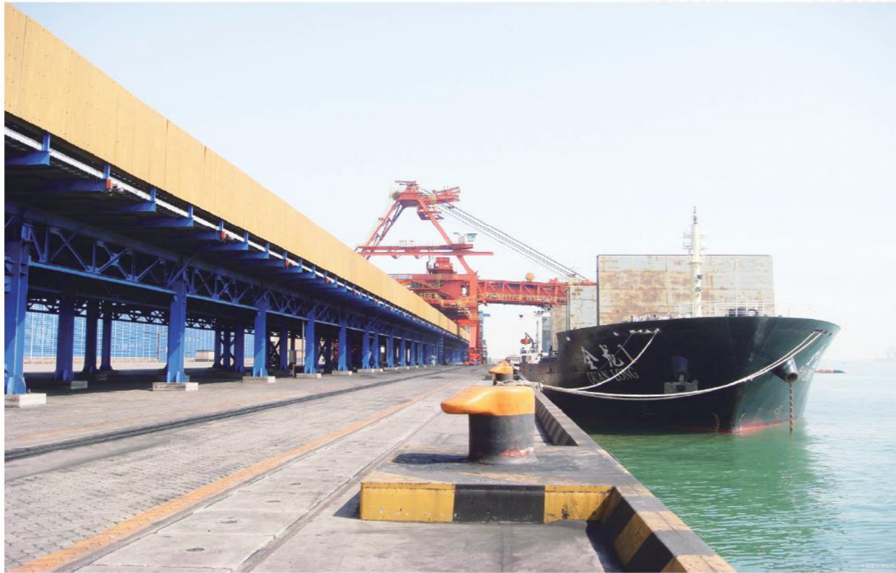
桥梁码头钢结构 Bridge pier steel structure