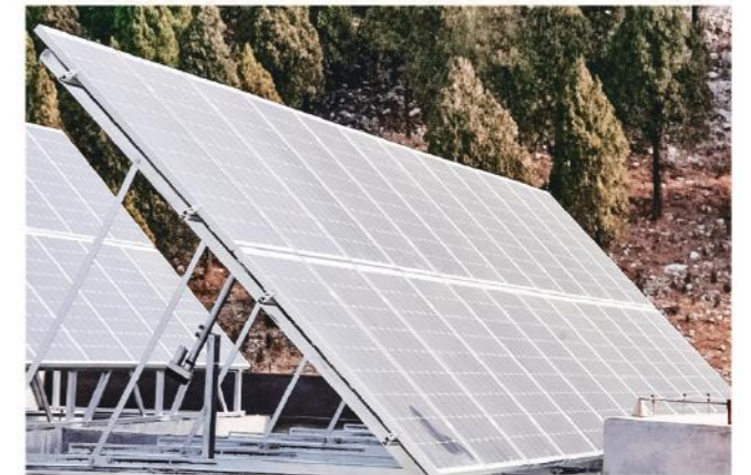
太阳能支架 Solar powered support