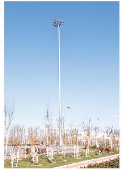
高灯杆 high lamp-post