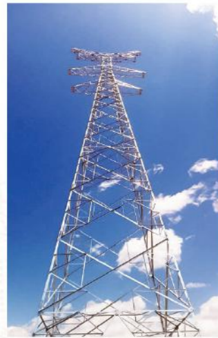
角钢塔 Angle steel tower