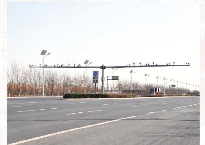
交通标志杆 sign gantry