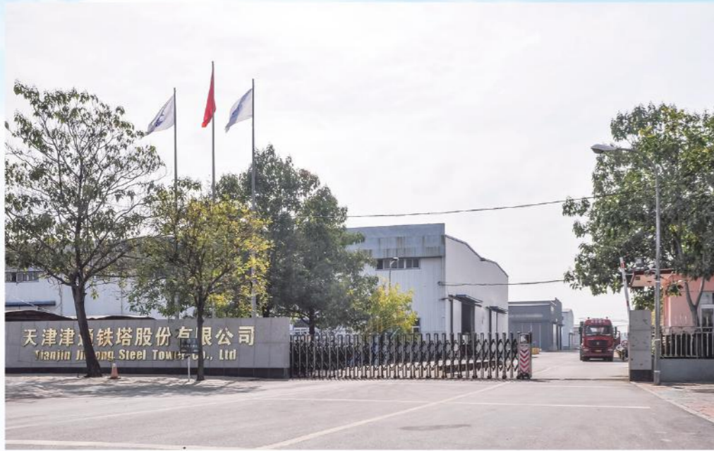
厂区门口 Factory gate