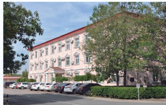
办公楼 Office Building