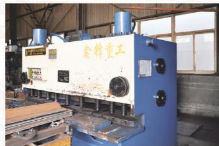
剪板机 Shearing machine