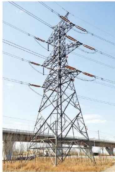
角钢塔 Angle steel tower