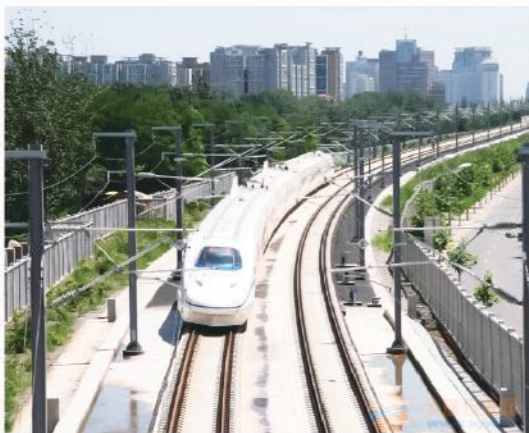
高铁钢结构 High-speed rail Steel structure