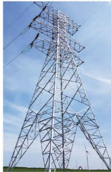
角钢塔 Angle steel tower