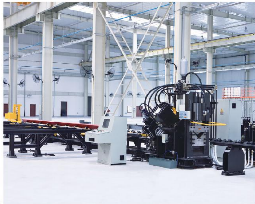
APM2020 型数控型钢联合生产线 APM2020 type steel combined production line