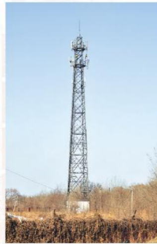
通信角钢塔 Communication angle steel tower