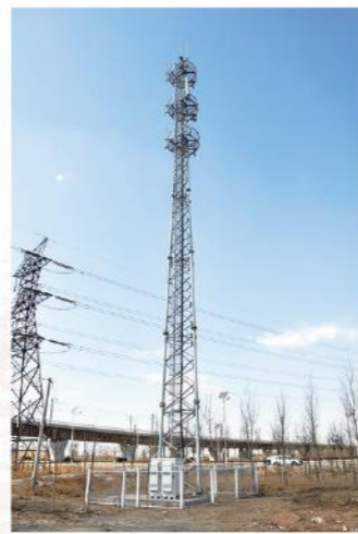
三管通信塔 Three tube communication tower