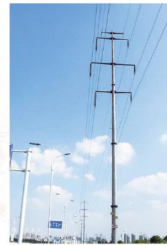
钢管杆 steel tube pole