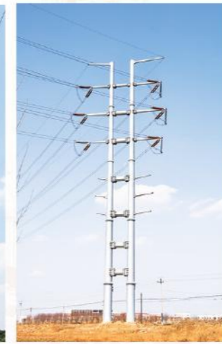
钢管杆 steel tube pole