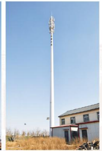
通信单管塔 Communication tower