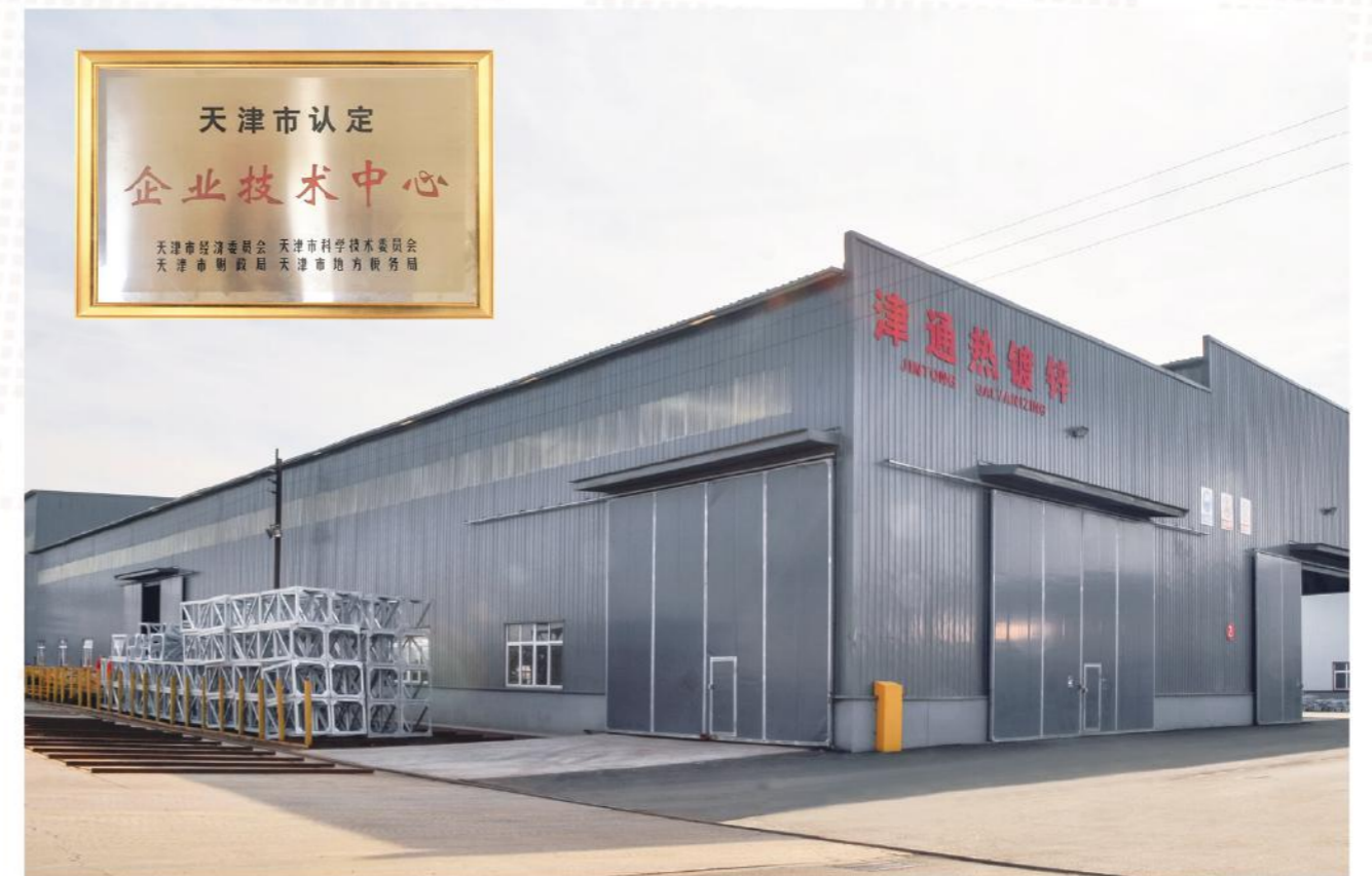
津通热镀锌 Jintong hot dip galvanize