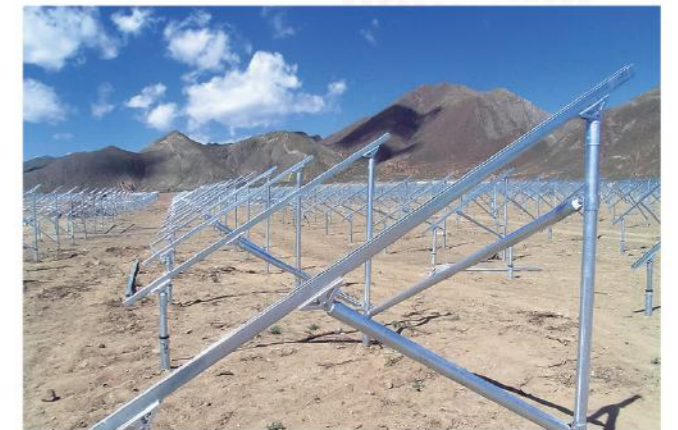
太阳能支架 Solar powered support