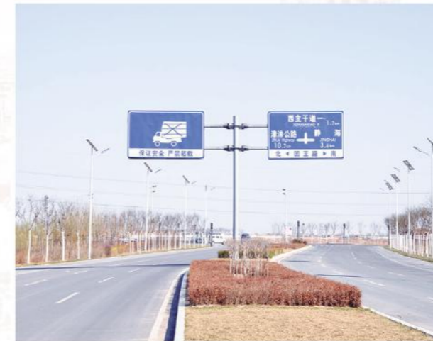
交通标志杆 sign gantry