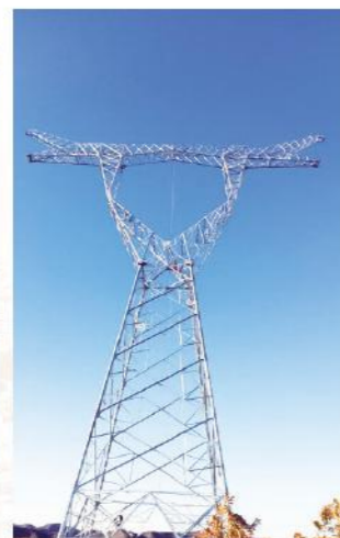
角钢塔 Angle steel tower