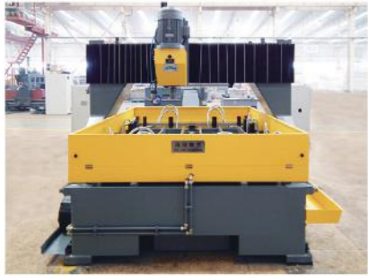
2016A 平面钻 2016A plane drill

角钢塔加工设备 Angle steel processing equipment