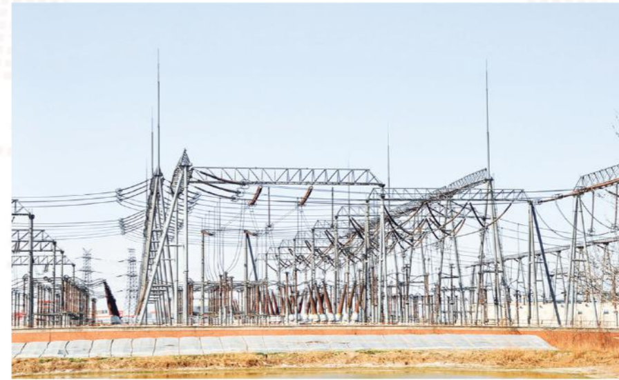
变电架构 Substation architecture