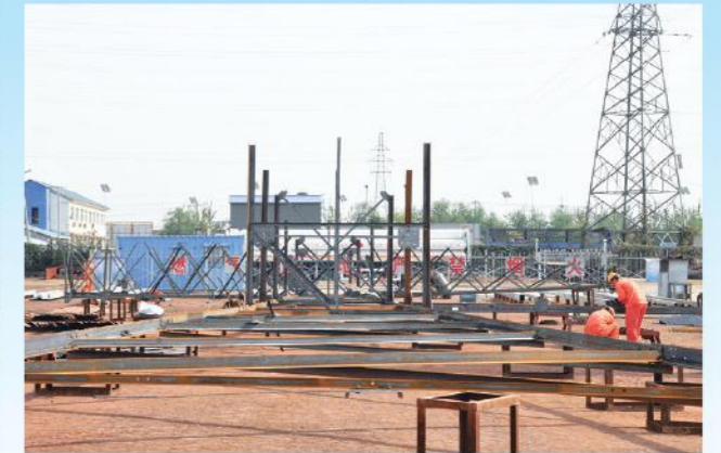
试组装 Test assembly