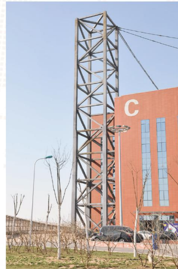
钢结构 Steel structure